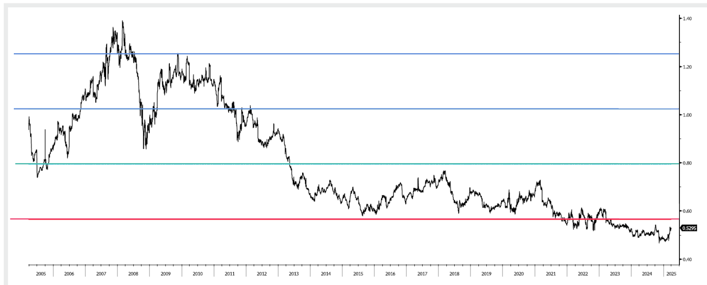
Figure 4: EM to DM index trailing P/B ratio

Data as of 31 st March 2025. The valuations presented here are for informational purposes only and should not be solely relied upon for investment or financial decisions.